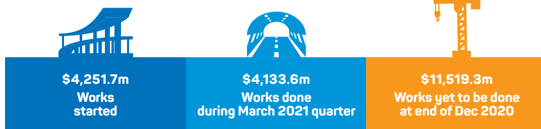
Civil works by activity, December 2020 quarter ($m)